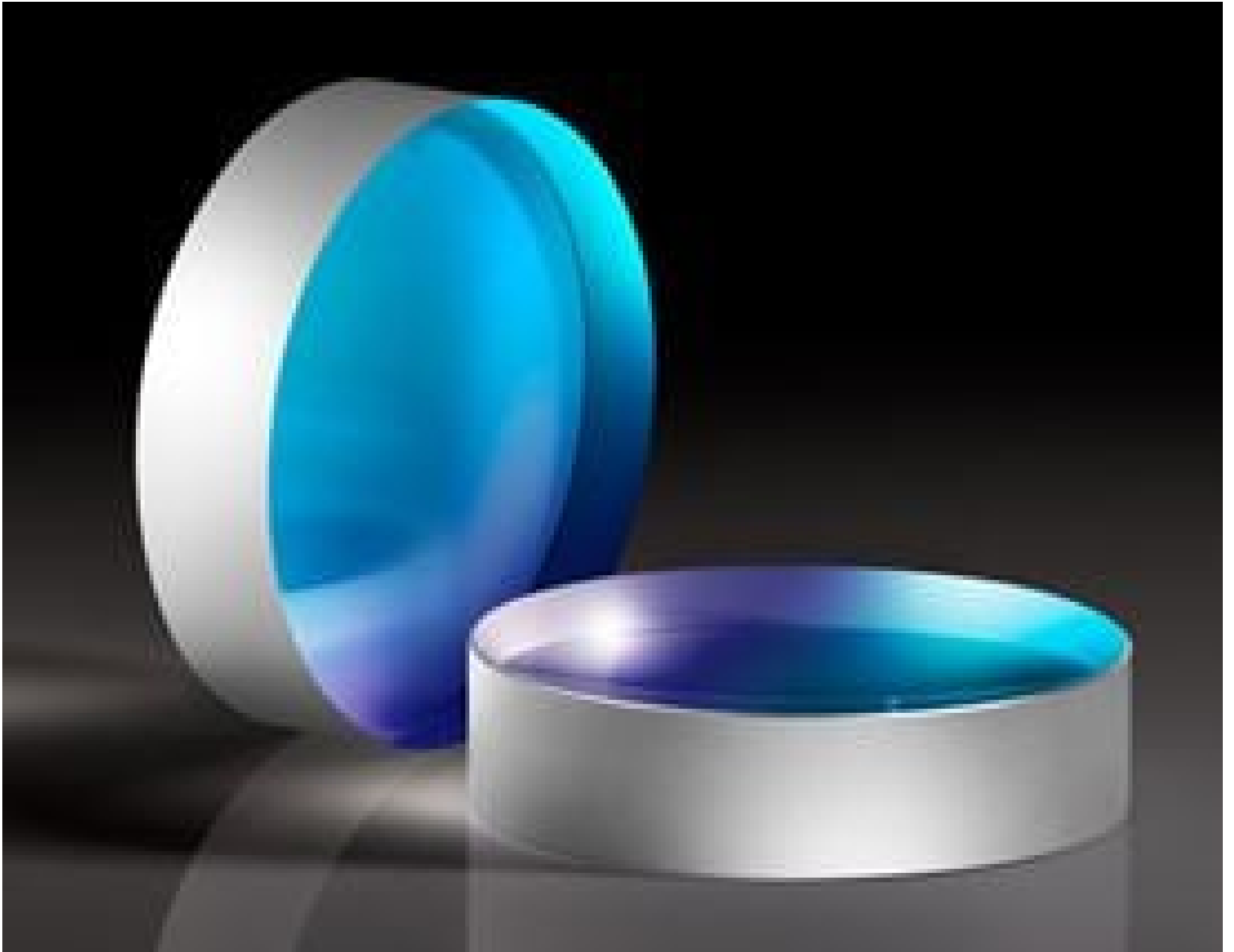
Laser Line Concave Mirrors