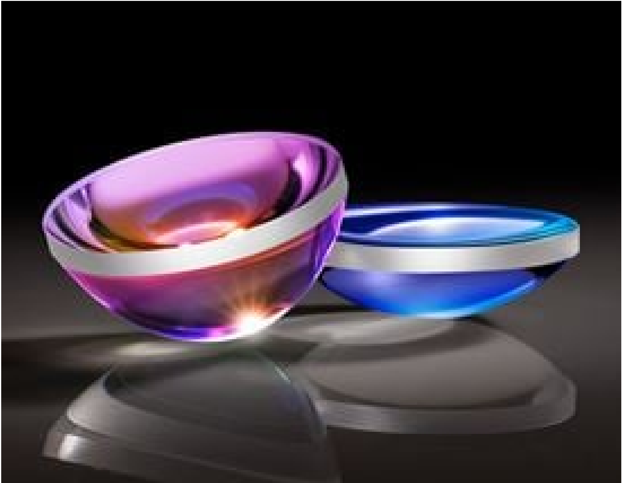
TECHSPEC UV Fused Silica Aspheric Lenses